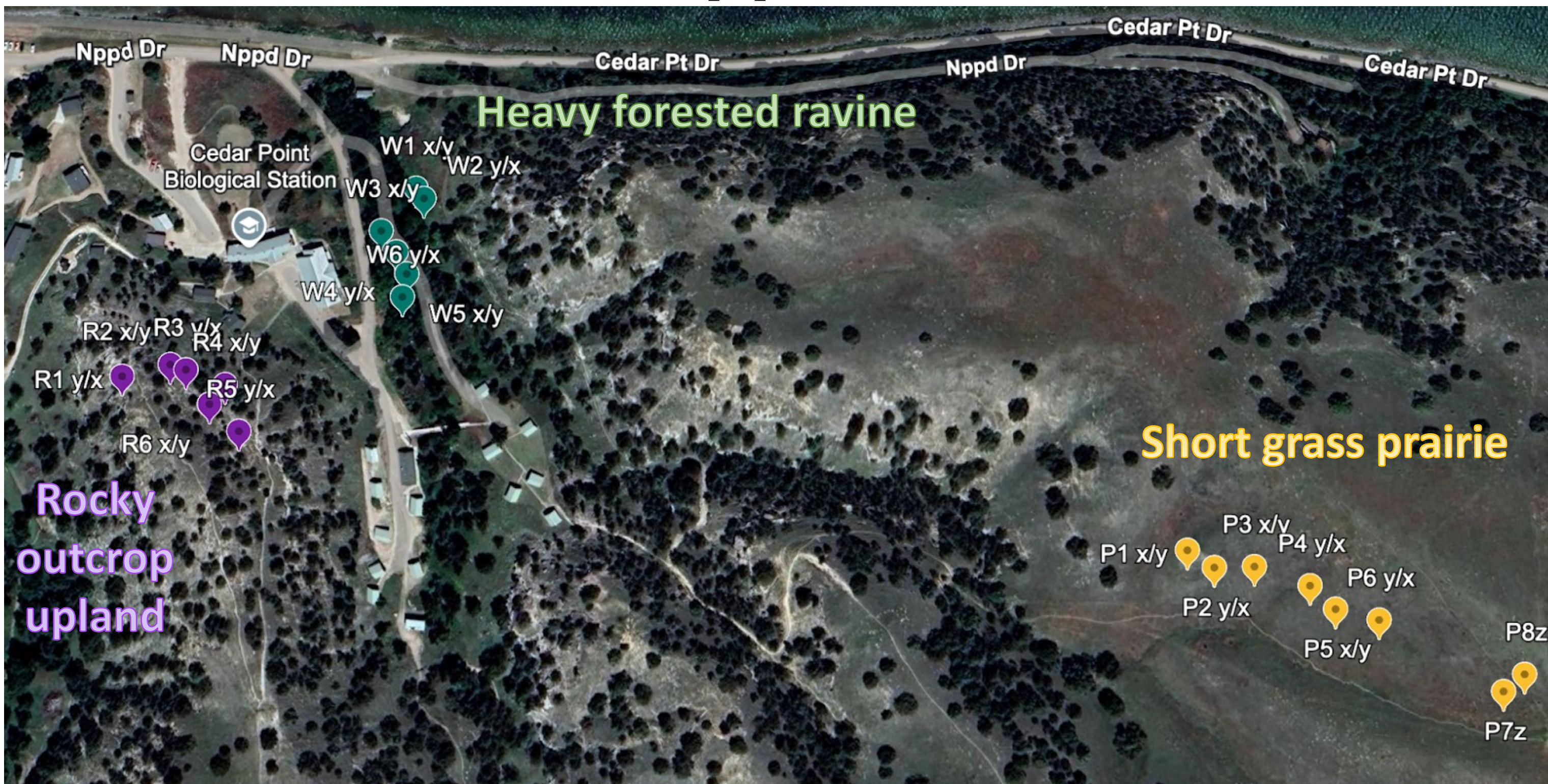
The map above shows the coverboard layout across the Cedar Point Biological Station in Keith County, NE.

This research lays the foundation for future studies, potentially revolutionizing how we monitor and conserve snake populations in diverse habitats.